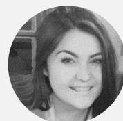
Ebony Hutt PR & Content